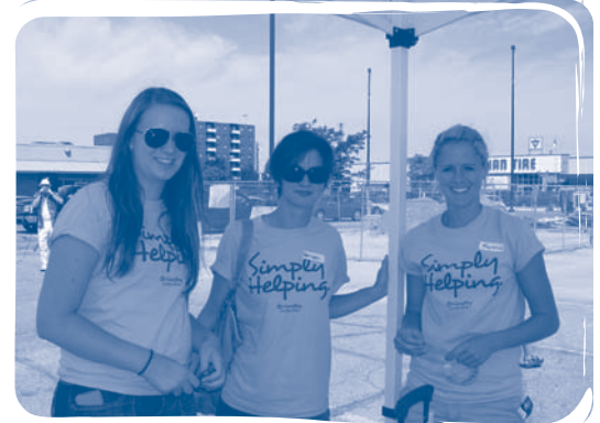
Simply Helping volunteers assisting at the festival of the forty

♥ Sweet Grillin' at the Lumber Yard - For the second year in a row, the Grimsby Life Centre was offered the opportunity to serve food at the Turkstra Lumber yard in Stoney Creek. We offered all of the food for free, and accepted free-will donations. This year, we gratefully made over $2,700! We would like to extend our sincerest appreciation to our friends at Turkstra Lumber, all the staff, volunteers and customers who supported us every Friday this summer!